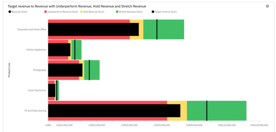
Figure 2. The new bullet chart helps compare performance metrics to other measures.